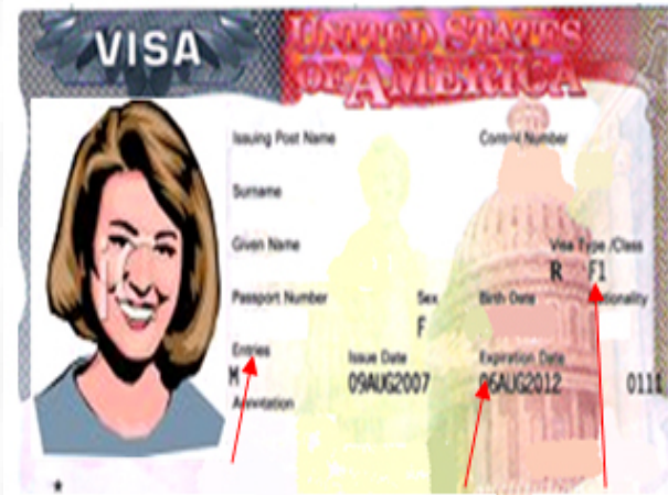
Number of Entries