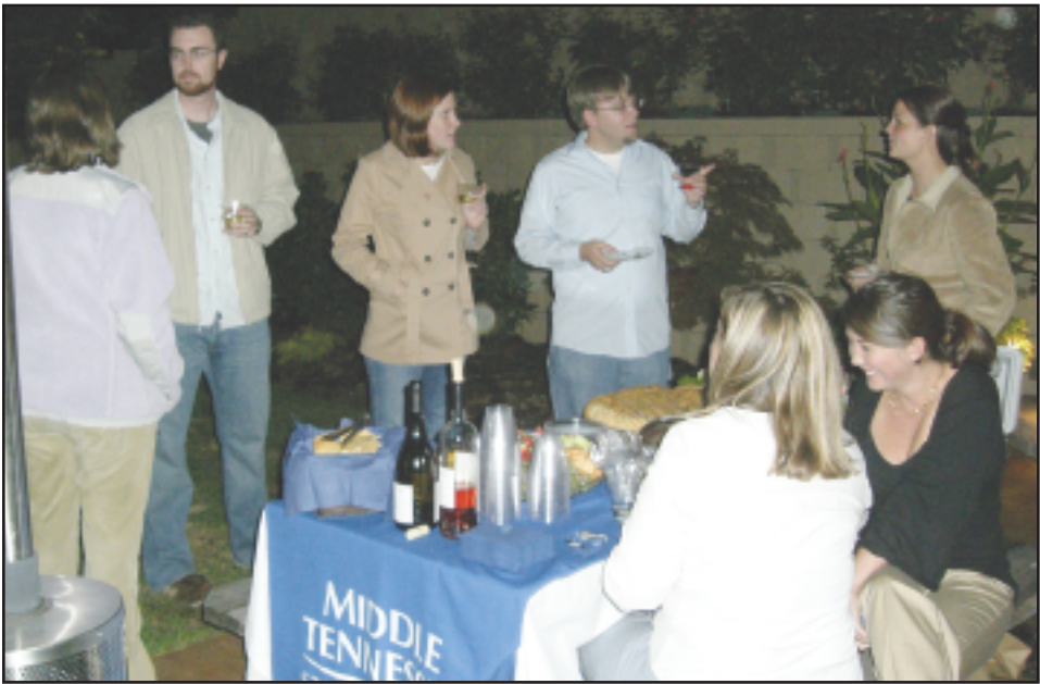
After the tasting, alumni gathered on the patio overlooking the vineyard to enjoy food and fellowship.