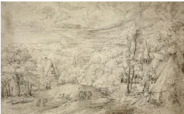
Fig. 1. Path through a Village , Pieter Bruegel the Elder, ca. 1552 [31, No. 5].

In this section, we apply the EMD framework to a stylometric analysis of a corpus of drawings by the great