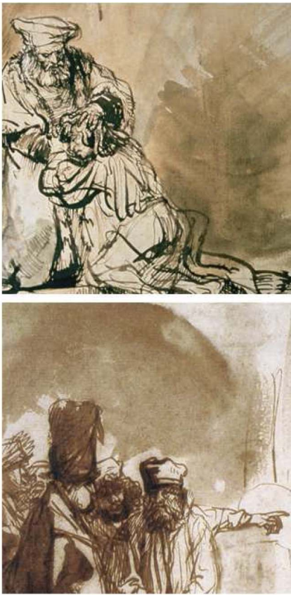
Fig. 6. Two details from authentic Rembrandt (drawing 09, top), The Return of the Prodigal Son , and questionable work (drawing 06, bottom), Mattathias at Modin , highlighting the similarity of the drawings in their use of ink wash.

The quantitative similarity of this drawing to all of the secure authentic drawings suggests that closer examination of the drawing's style, its materials, and its provenance may ultimately reveal it to in fact be a genuine Rembrandt.