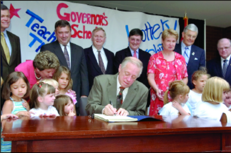
FOR ALL THE KIDS —Surrounded by children from MTSU’s Womack Lane Day Care Center, Gov. Phil Bredesen signs the state’s $26.3 billion 2006-07 budget as state and local dignitaries look on. The measure includes $40 million in new operating funds for higher education and features 2 percent raises for higher ed employees.