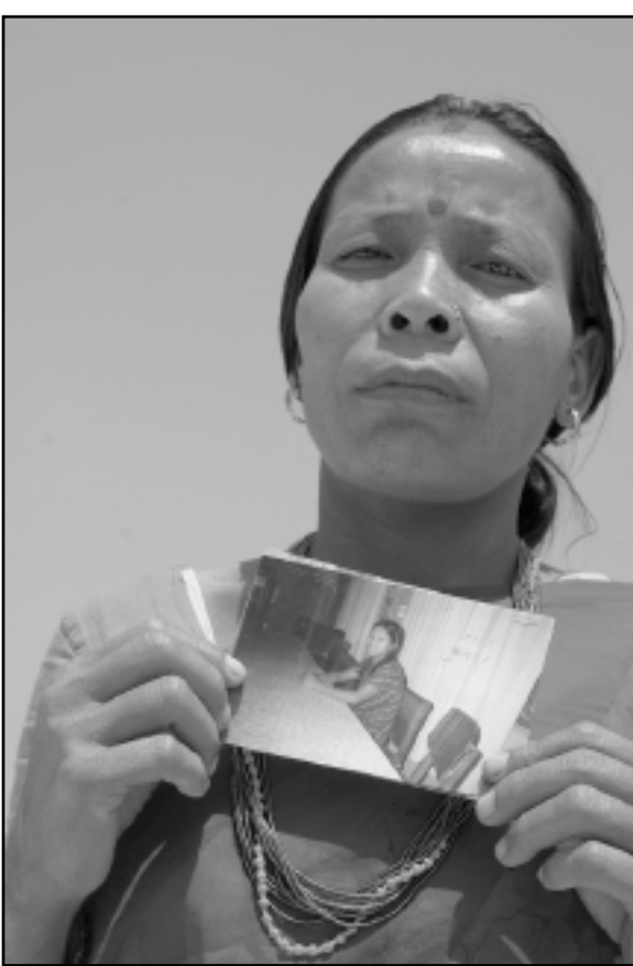
DESPERATE SEARCH —A Nepalese mother holds a photo of her missing teenage daughter, who was trafficked into a brothel in Mumbai, India. The woman vowed to search “until I find my daughter or die. I am not leaving here without her.”