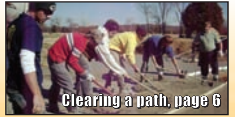
Clearing a path, page 6

Bangladeshis enrich student's life, page 2 Art faculty's work 'Revisited,' page 4 Traffic changes on Old Main Circle, page 6