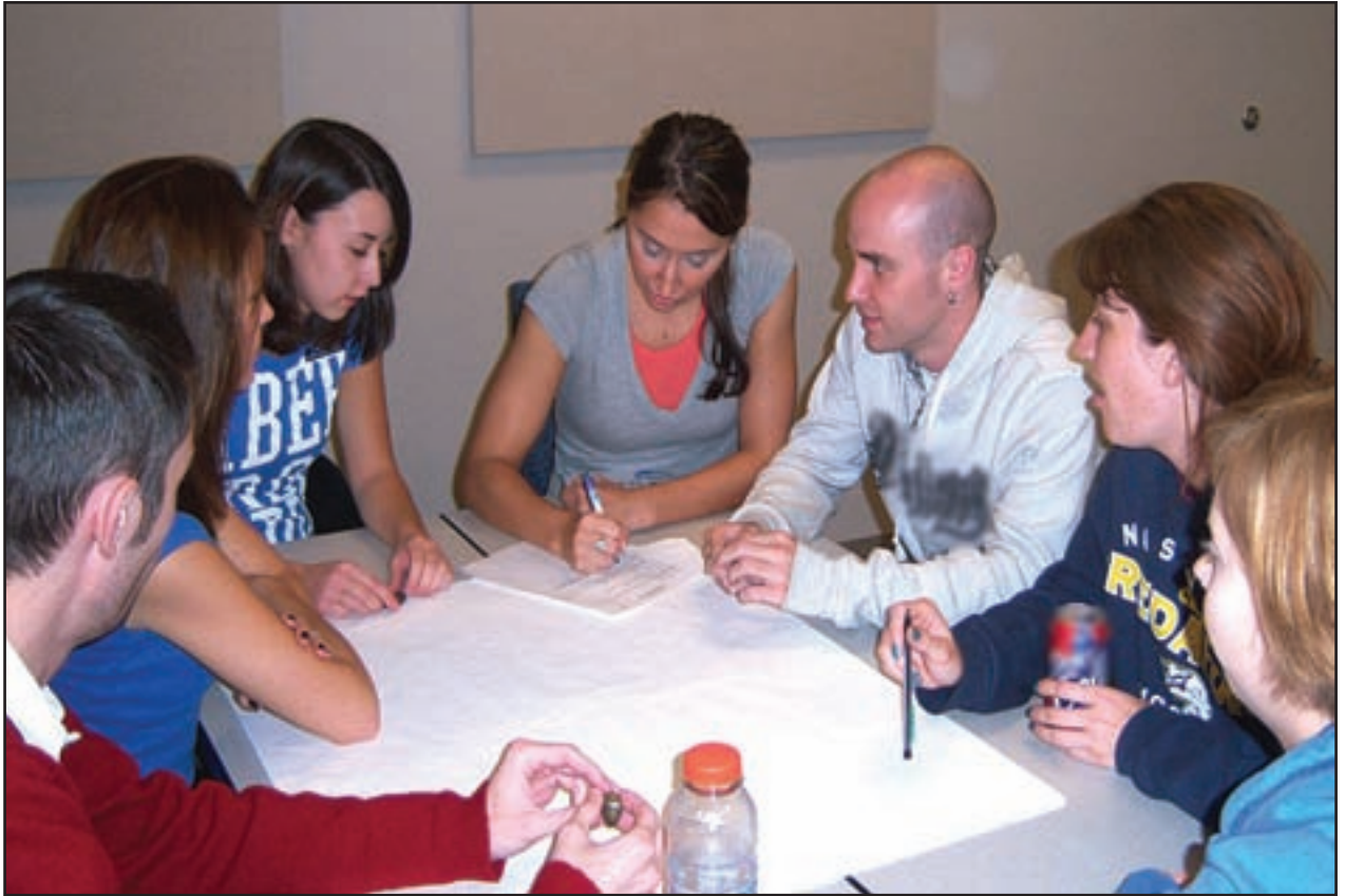
HEALING ARTS —Nursing students from MTSU and Austin Peay State University discuss techniques for calming patients and helping speed their recoveries during an October guided-imagery workshop for health care professionals in the Cason-Kennedy Nursing Building. Another guided-imagery workshop, scheduled for Feb. 7 at MTSU, was intended to continue the collaboration between the two universities’ nursing programs.

“This is useful information. I will use guided imagery in my own daily life to increase feelings of well-being and to promote relaxation,” an MTSU student