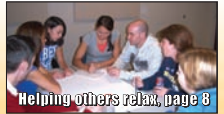
Helping others relax, page 8

ELS Center finds new home, page 2 Sells to lead Division of Student Affairs, page 3 Institutional Research collecting data, page 7