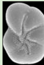
Foraminifera Haynesina germanica