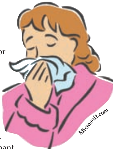
See 'Flu' page 5

The U.S. Centers for Disease Control and Prevention have defined children and young adults, pregnant women, caregivers for children younger than six months of age, and health care providers as the high-risk groups that should get the vaccine first. Younger children might