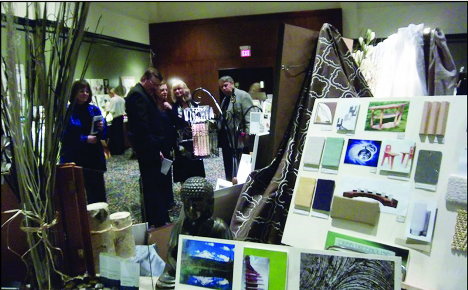
DESIGN ON DISPLAY —Passers-by admire the work of MTSU interior-design students on display in the James Union Building’s Tennessee Room in February.