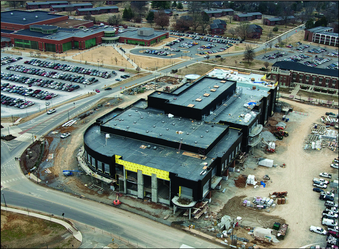
ON THE WAY UP —This aerial view of construction on the east side of MTSU's campus, looking southeast, shows the rapid progress of the new Student Union Building, which is scheduled to open in spring 2012. At the upper left of the photo is the Student Health, Wellness and Recreation Center, while just above and to the right of the new SUB is the Paul W. Martin Sr. Honors College Building. The campus roundabout, which is partially visible at the lower left of the photo, will get a partner on campus later this year with the addition of another roundabout on MTSU Boulevard near Scarlett Commons.

Completed projects around campus include the Tucker Theatre renovation;