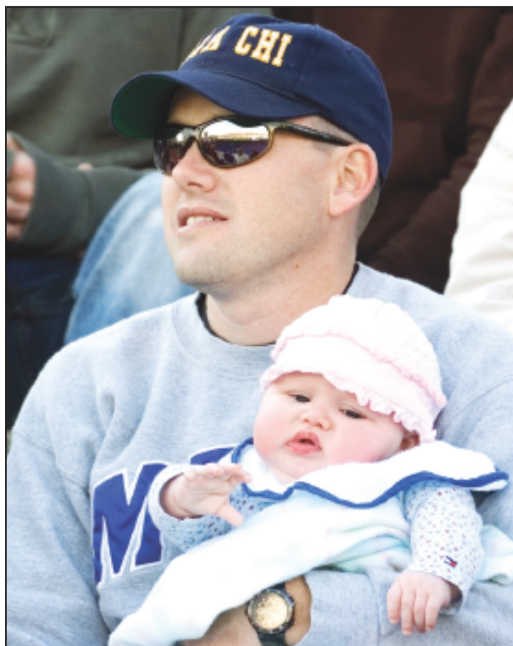
A father and baby daughter watch the 2006 homecoming game.