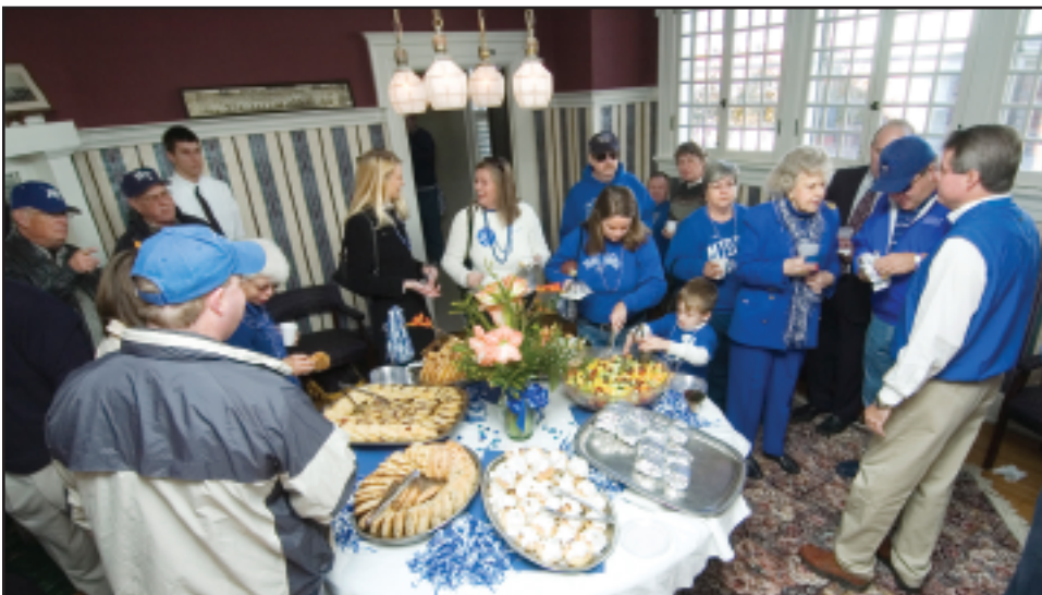
Alumni, friends and MTSU staff enjoy the pregame food at the MTSU Alumni House.