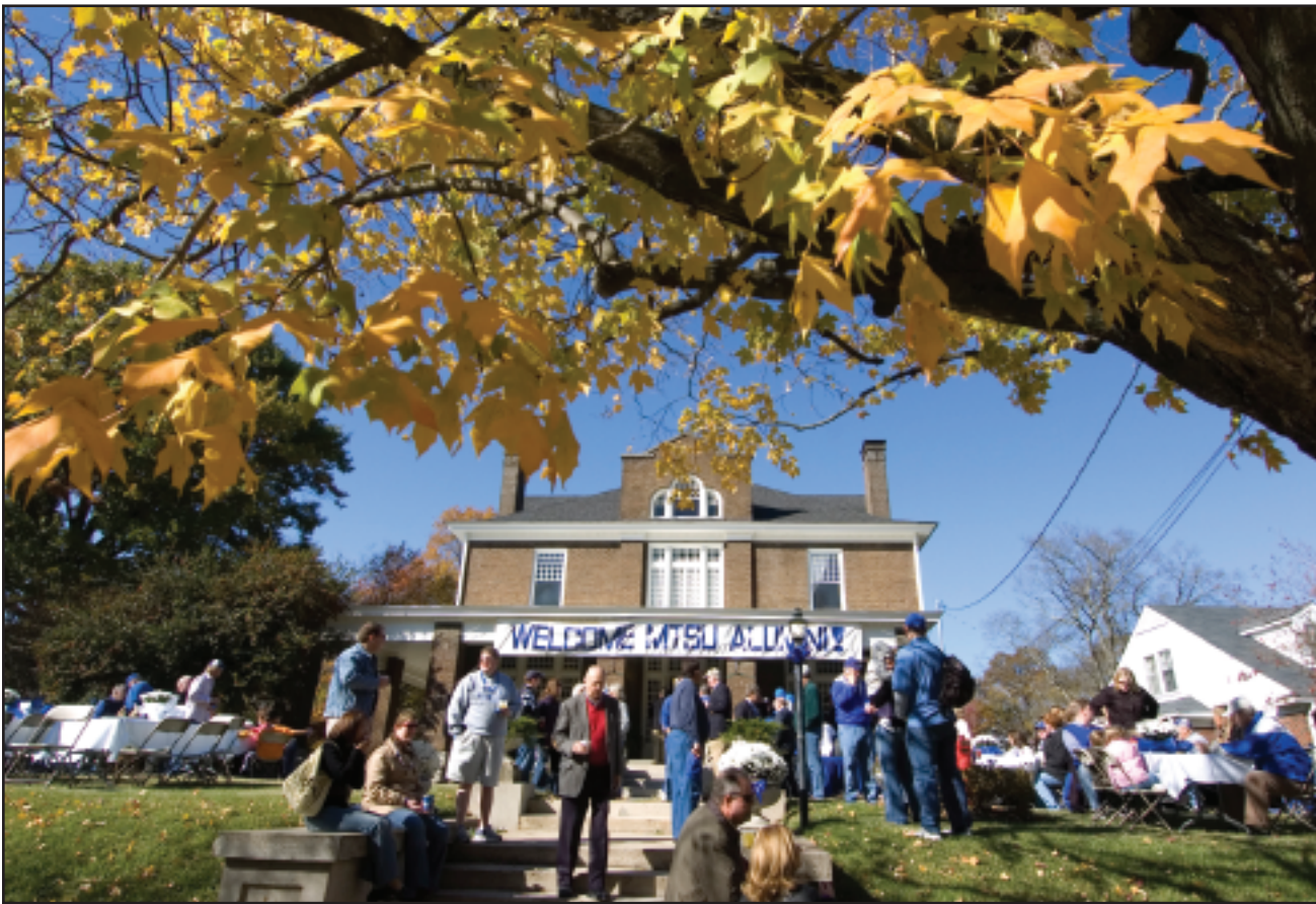
Alumni and friends attend the Mixer on Middle Parade-Watching Party on the MTSU Alumni House front lawn.