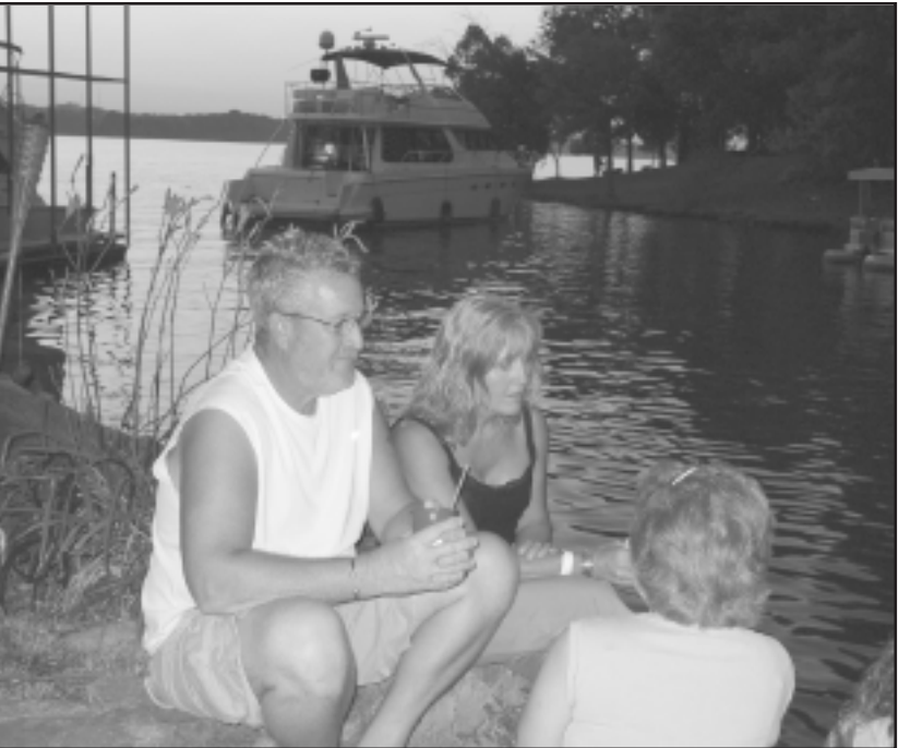
Sitting on the banks of Old Hickory Lake, alumni and friends enjoy the aerospace party . The group raised $8,000 for scholarships.