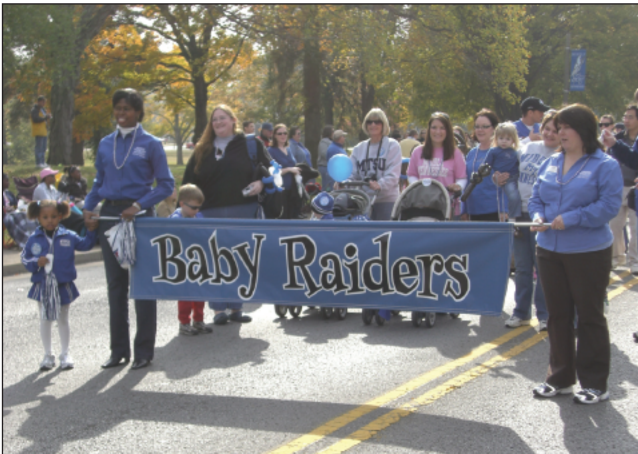
The Baby Raiders portion of the Homecoming Parade is a favorite for those walking and those watching.