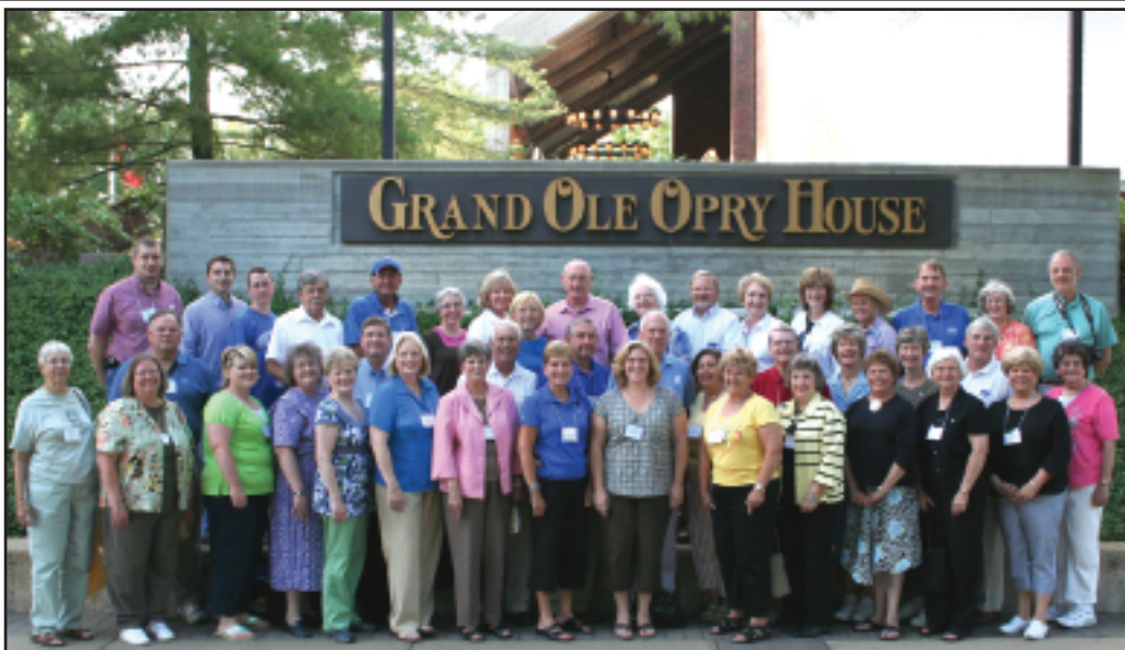
MTSU Alumni Relations

The inaugural Alumni Summer College field trip was a highlight of the program. The class traveled to Nashville, where they received VIP treatment as they toured the Ryman Auditorium and enjoyed the Grand Ole Opry.