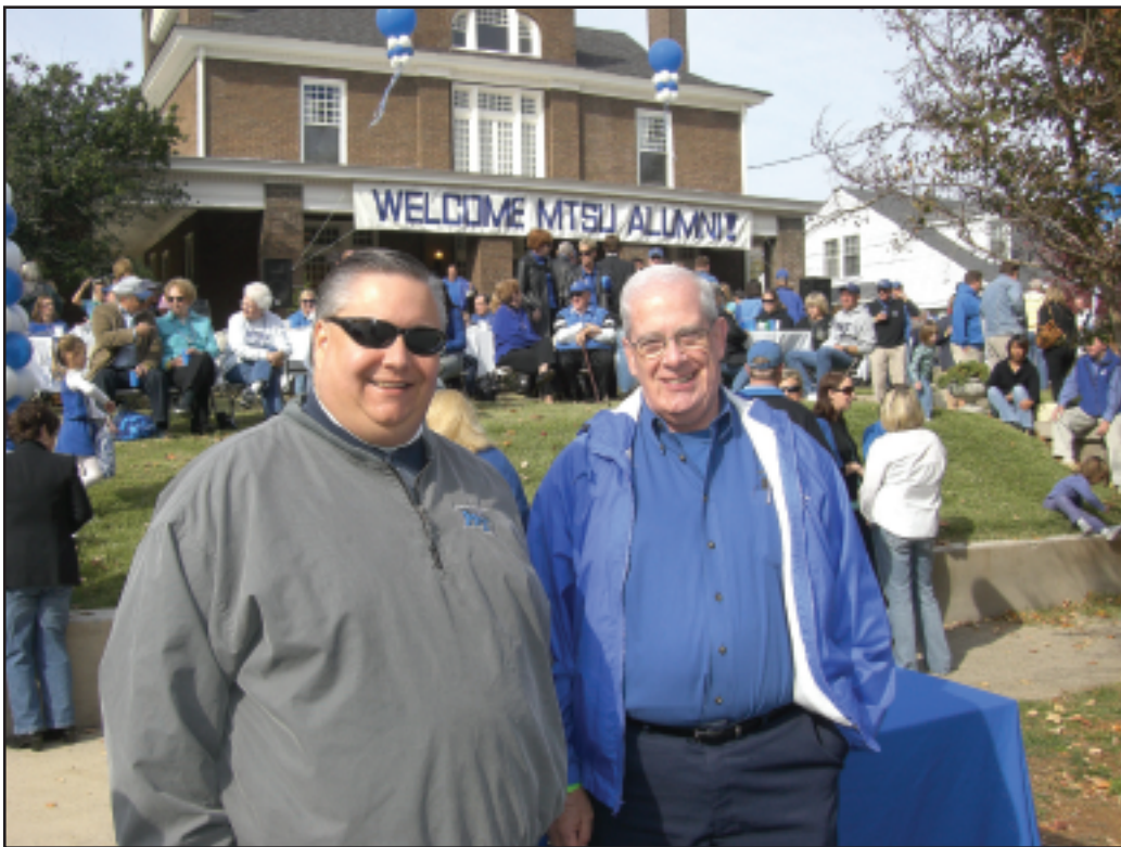
MTSU Alumni Relations