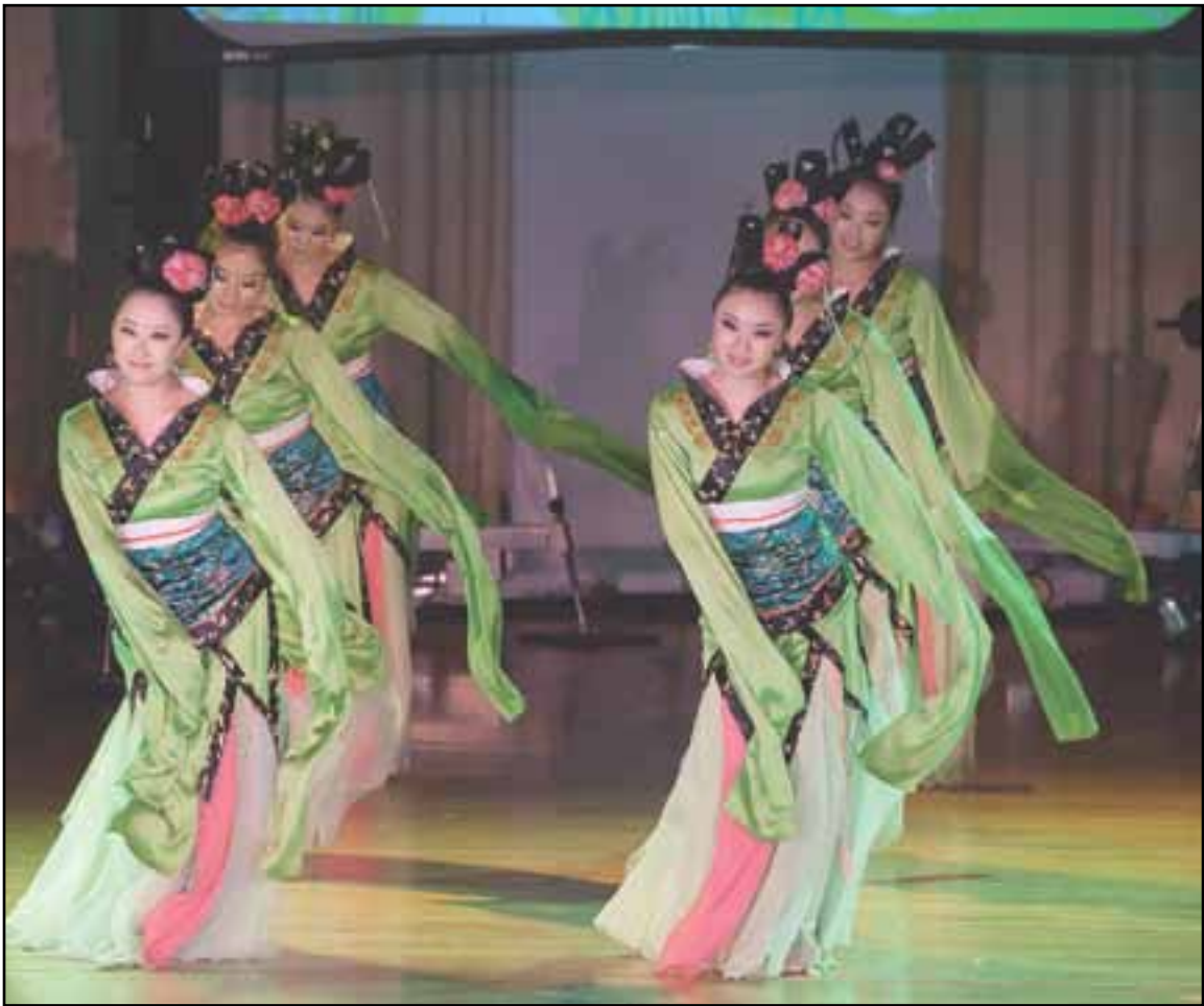
(Right) Dancers perform “Spring Outing,” a classic Chinese dance incorporating postures from the Han dynasty, during “An Oriental Monsoon.”