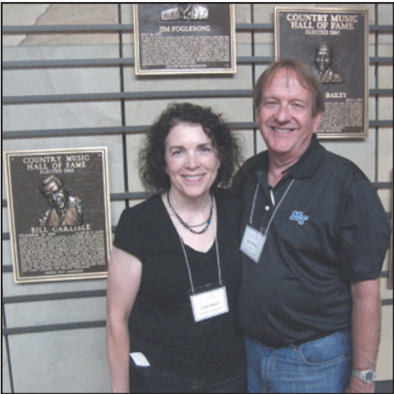
Alumni Relations photos