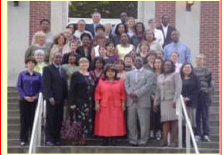
The President's Commission on the Status of Women

Proposals will be reviewed by selected members serving on the Academic Issues Subcommittee of the President's Commission on the Status of Women. Successful proposals should demonstrate a commitment to innovative teaching techniques as well as careful consideration of the intersection of women's concerns with notions of race/ethnicity, class, and sexual orientation. Priority will be given to courses that are developed or revised for the undergraduate curriculum and those that can be implemented within two years. Eligibility is limited to faculty who have not received a Curriculum Integration grant in the past four years.