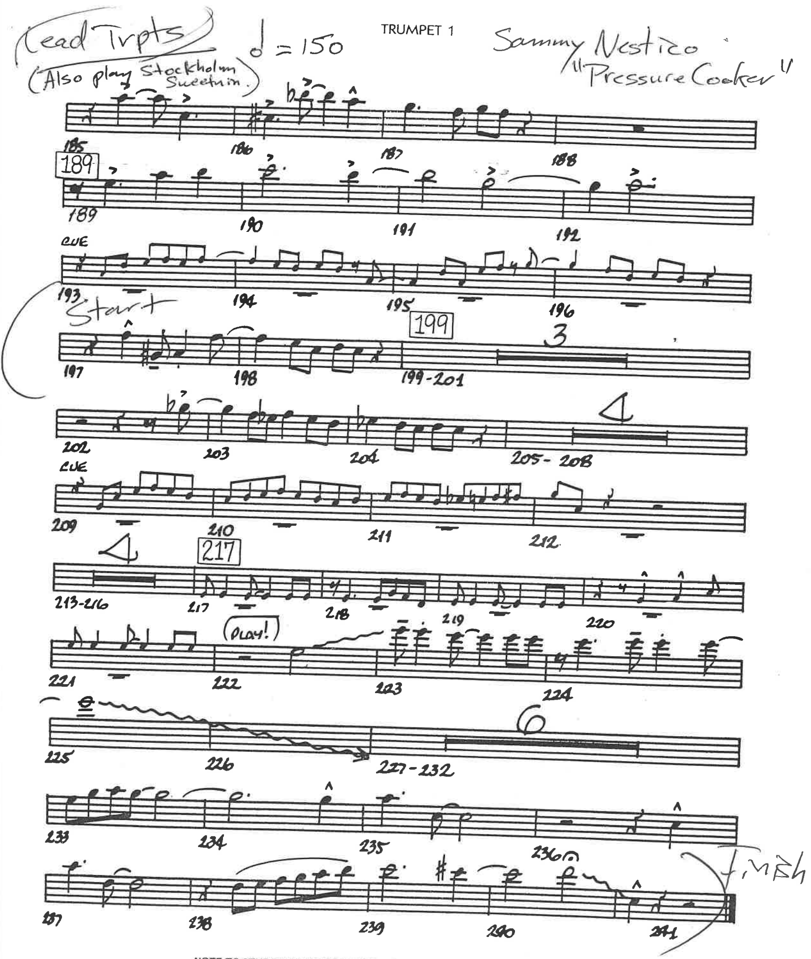
NOTE TO STUDENTS AND TEACHERS - The writers of this music are dependent upon its sale for their livelihood. Duplication by any means is not only illegal but it inhibits the creation of new music for your use.