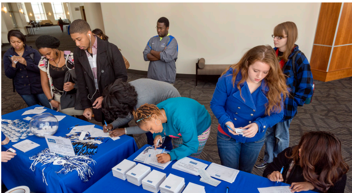
The College of Graduate Studies partnered with several other campus groups to reinstitute the tradition of Senior Day in November.

All these efforts support our goal of branding MTSU as the emerging leader in graduate education in Tennessee.